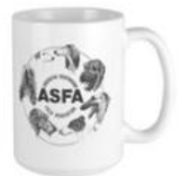
MORE COLORS AVAILABLE