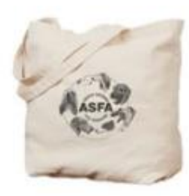
<u>Tote Bag</u> $15.99

https://www.cafepress.com/americansighthoundfieldassociation/8589238