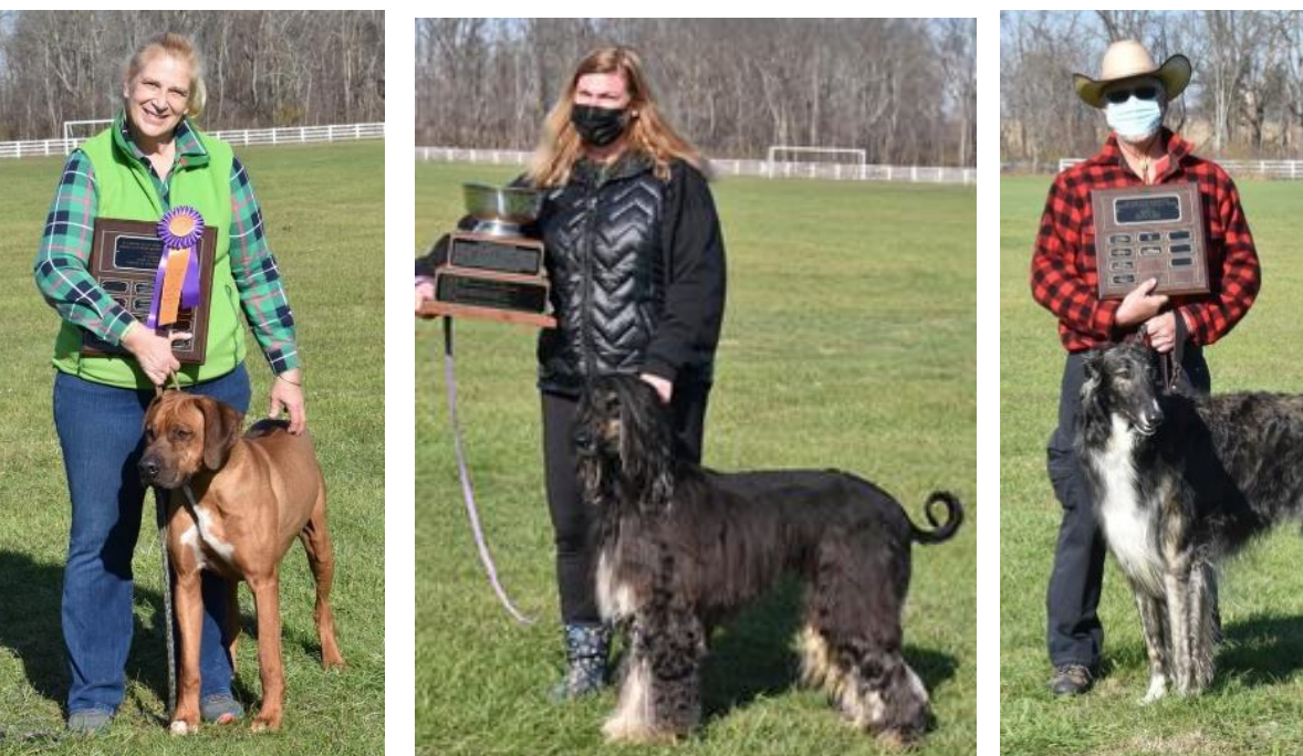
(continued on next page)