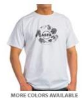
Light T-Shirt $19.99